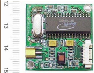
Prox - Module